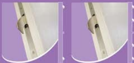
2 Hook Locks