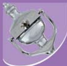
Urn Knocker with spy hole