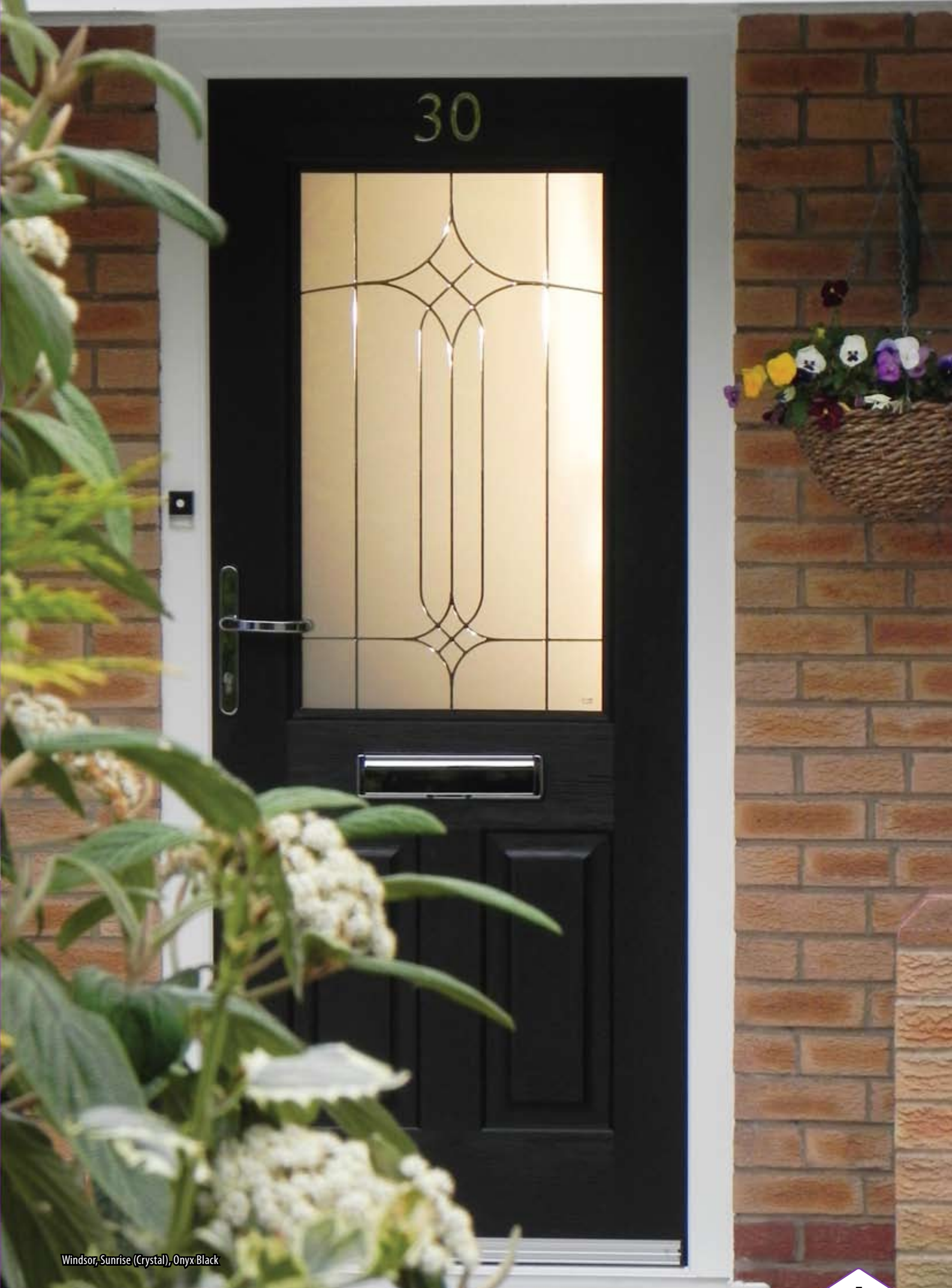
Windsor, Sunrise (Crystal), Onyx Black