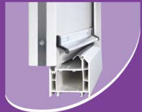
3. Full PVC-U Threshold