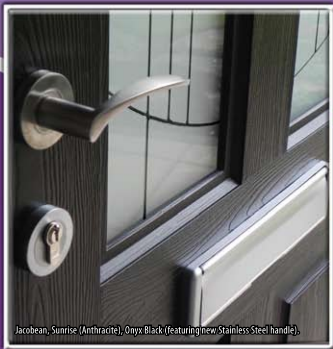
Jacobean, Sunrise (Anthracite), Onyx Black (featuring new Stainless Steel handle).

As an added bonus, Simple Lite glass designs and sideunits are durable and easy to clean as the design is encapsulated within the double glazed unit so the surfaces are smooth overall.