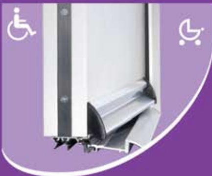
1. Low Aluminium Threshold (Document L compliant) (Suitable for Tie-Bar)