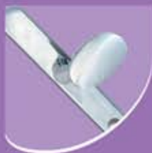
Lever/Pad (Exterior only)