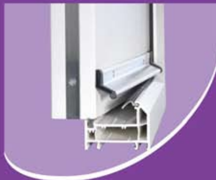
2. Slim PVC-U Threshold