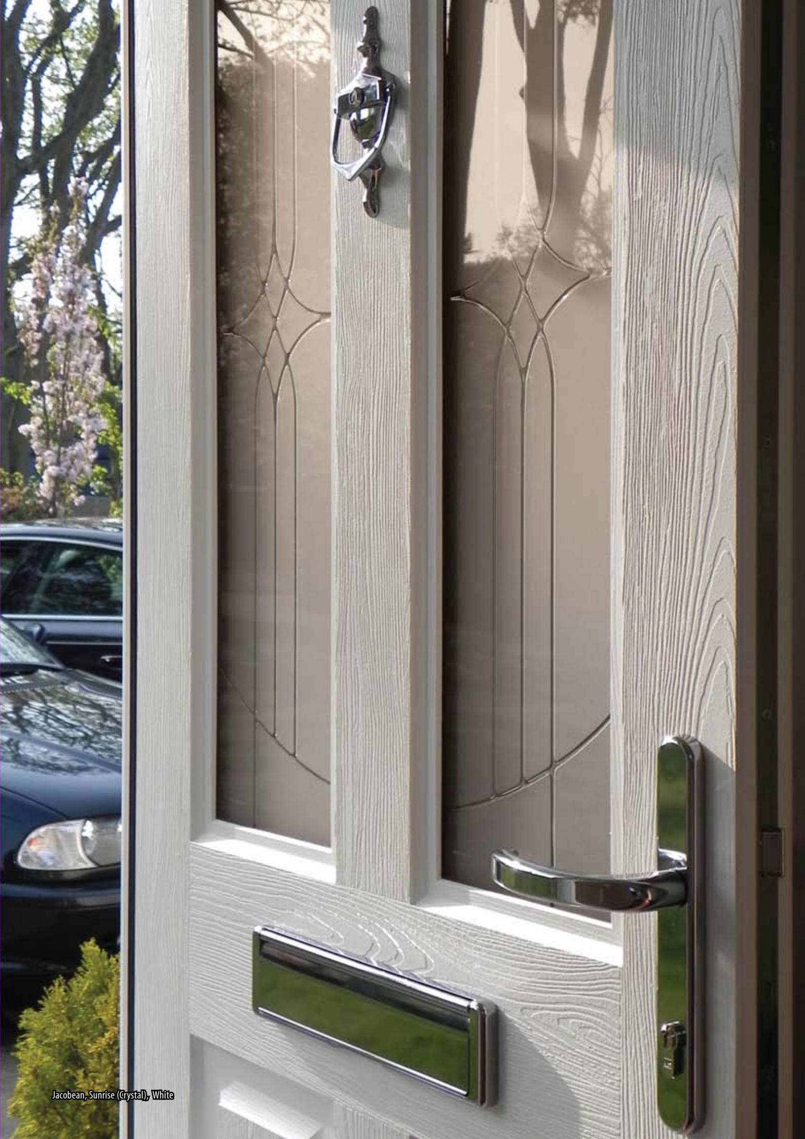
Jacobean, Sunrise (Crystal), White