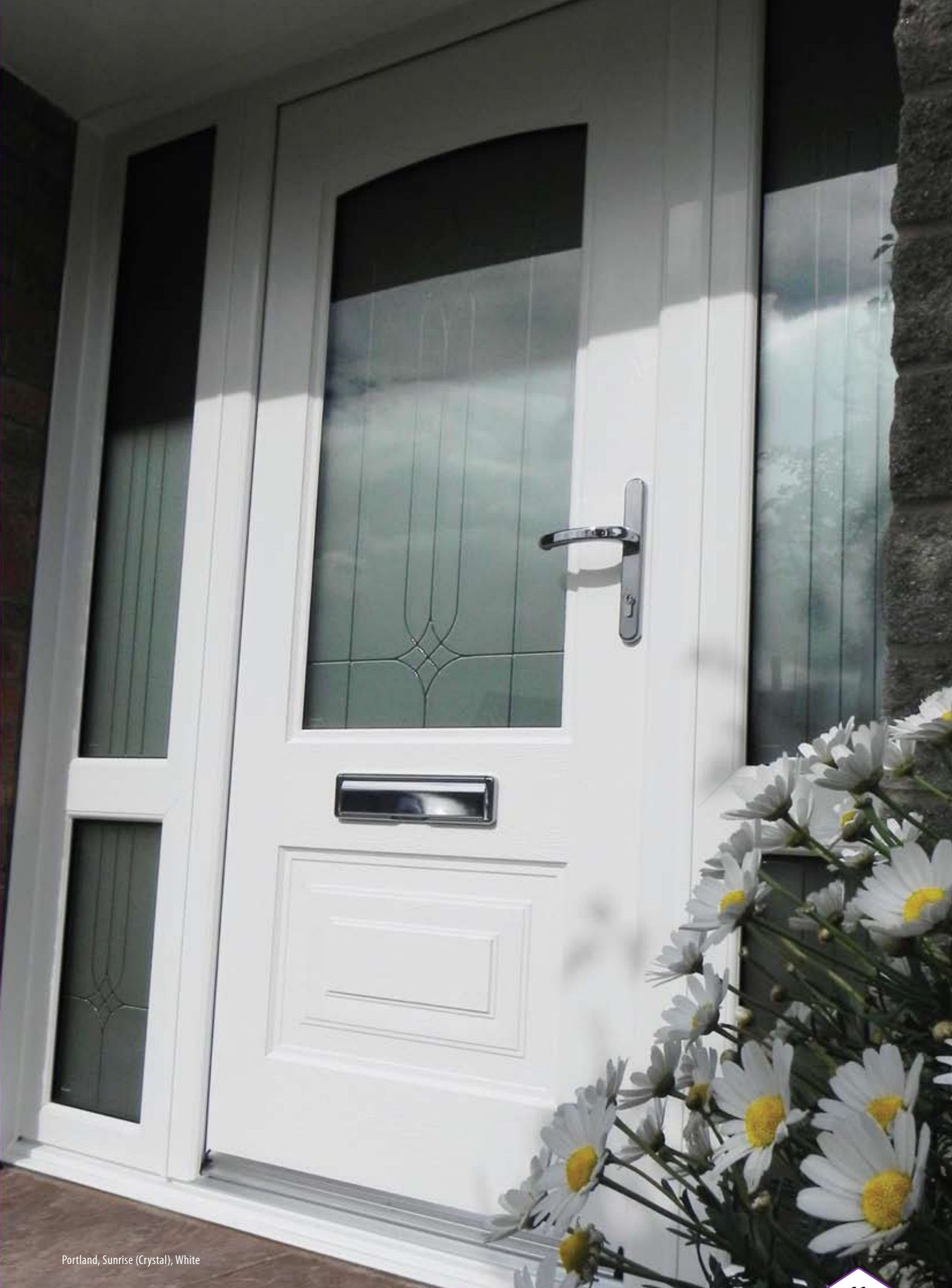
Portland, Sunrise (Crystal), White