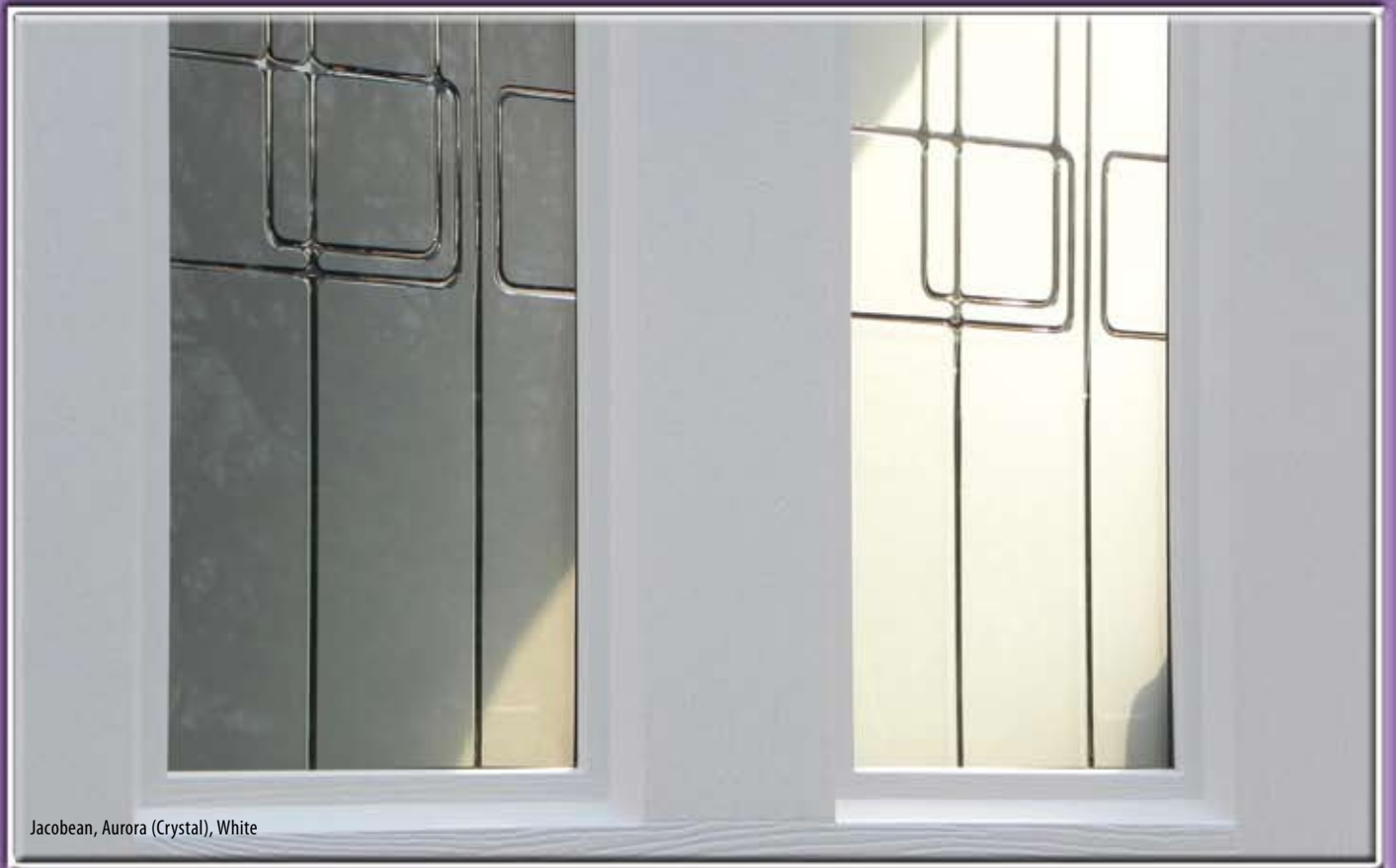
Jacobean, Aurora (Crystal), White