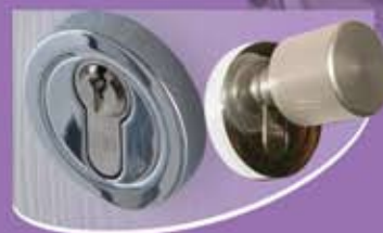
Escutcheon & Thumbturn