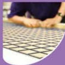
Wire Mesh Reinforcing