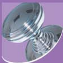
Victorian Centre Knob